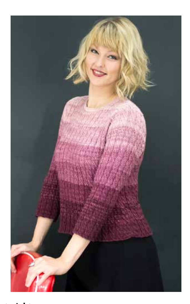
8904 Short Gradient Nina Jacket, right