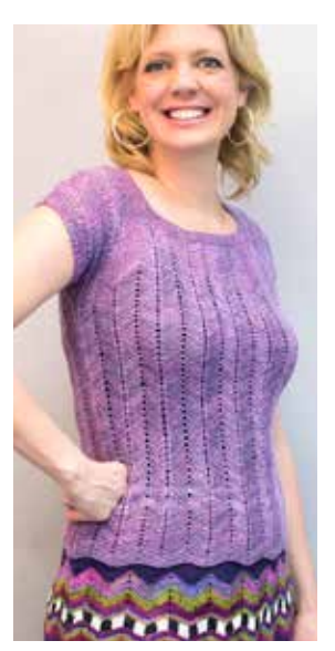
8001 Chevron Tee: The perfect layering piece! One pattern covers 4 different looks: from left, Single Delicato, sheer; Double Delicato, full coverage, Euroflax LaceWeight Linen, sheer; Euroflax Sport, full. Shown in Jade 1 (2, 2, 2, 2) Delicato