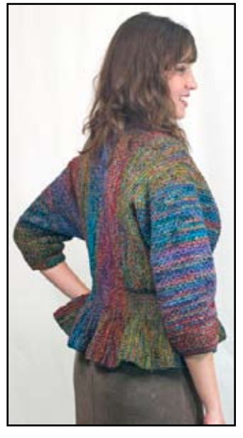
5904: Left: Ooh, la Oscar!

Our shapely peplum jacket took its inspiration from Oscar de la Renta! Worked from sleeve to sleeve in Half Linen Stich, a Linen Stitch waisband draws in to hug the body, while a Garter Stitch peplum is defined through short rows. Magnificent Merino Mia is used in multi-colored Coral Reef, then held double strand with the more tonal Copper Penny, Plum Dandy, Blue Lagoon, and Moss.