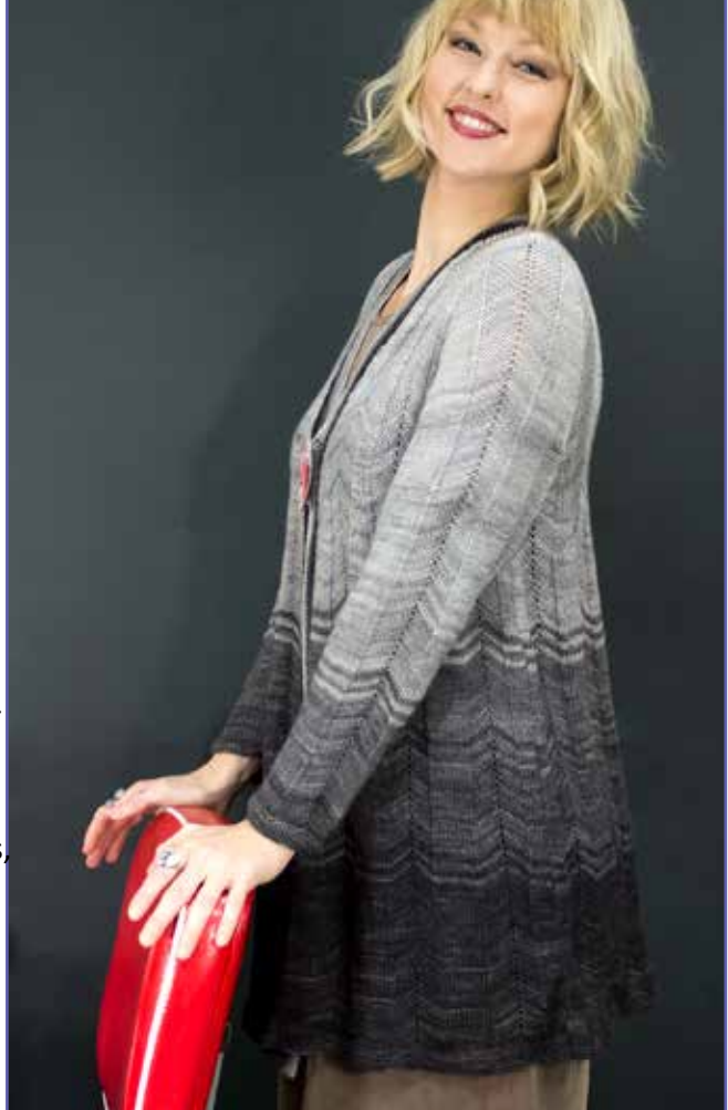
Chevron sections separated by simple stockinette stitch give Brigitte's Nina Jacket a certain panache, enhanced by a gradation from deep smoky taupe to barely there color.

Cont as est with Color 1 to 31 (31½, 32)". BO all sts firmly.