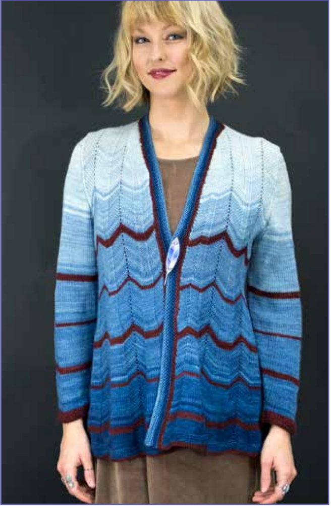
An abbreviated swing jacket in a rich gradation of blues is punctuated by a pop of saturated Bittersweet. Chevron sections separated by stockinette stitch become graphically dynamic with the addition of a contrasting color.

Shape Armholes: Join Color 2 and BO 8 (10, 11) sts beg next 2